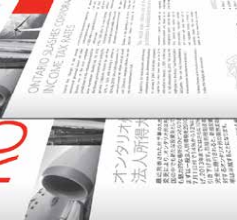
◆ 1 Client : Government of Ontario Media : 4-page brochure