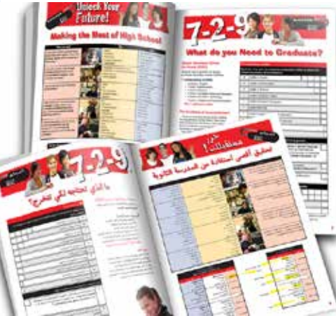
◆ 5 Client : Hamilton-Wentworth District School Board Media : 16-page brochure