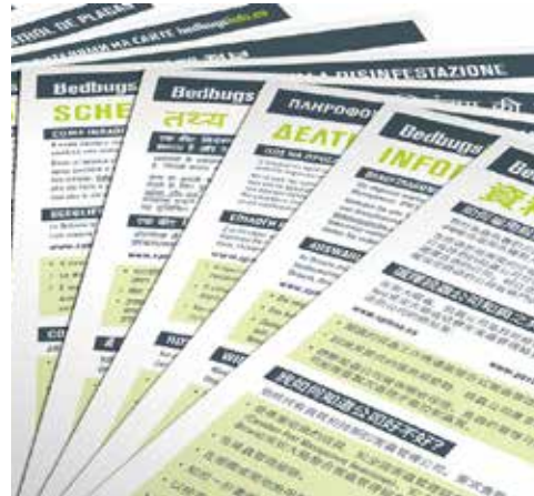
◆ 2 Client : Government of Ontario Media : 11 Information sheets