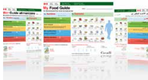
◆ 6 Client : Government of Canada Media : Interactive website